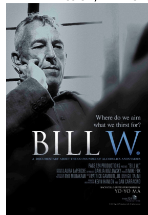
Bill W.: The Documentary 7:30PM

ON A 12' SCREEN and IN STEREO FREE ADMISSION, FREE POPCORN, Low-Priced MUNCHIES